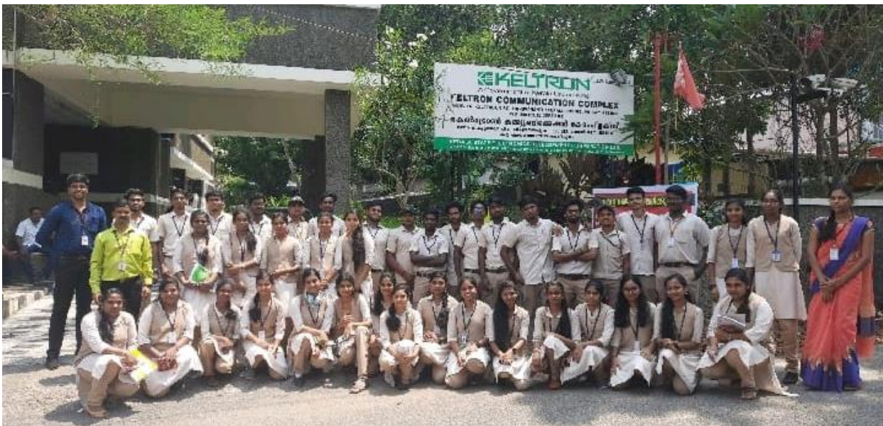
Industrial visit to keltron communication complex by III B.E ECE students