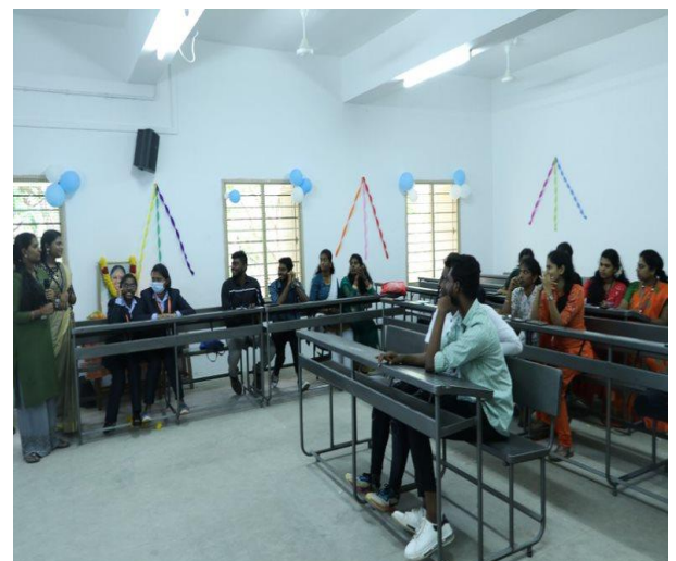
Best Management Team Competition