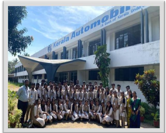
MBA first year students during a visit