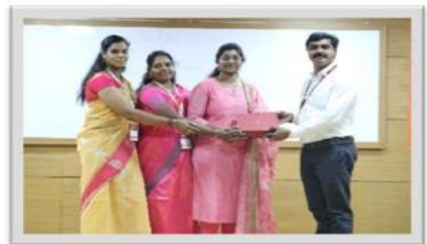
Gift to Guest