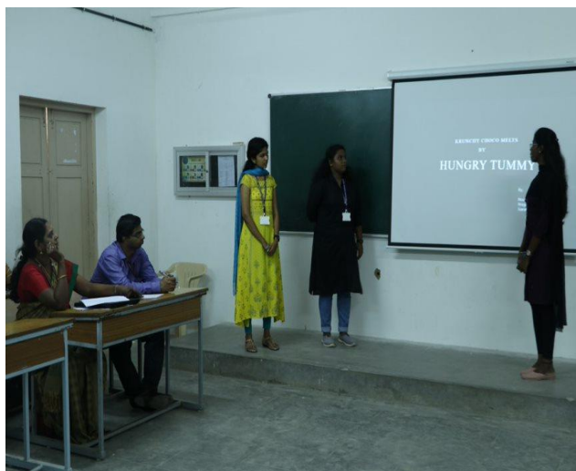
Business Plan Competition