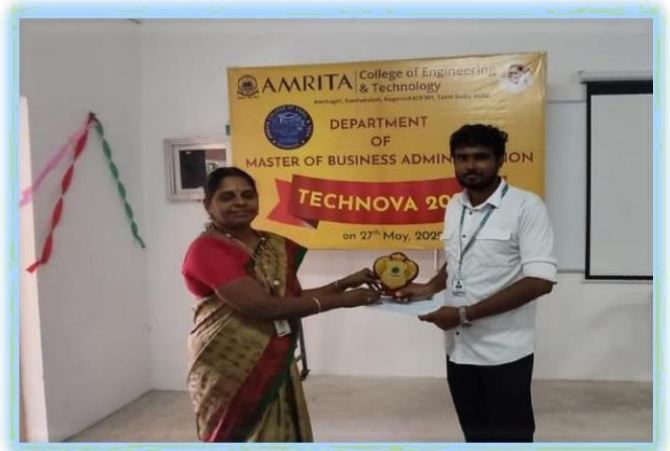
First Prize Winner of Best Manager