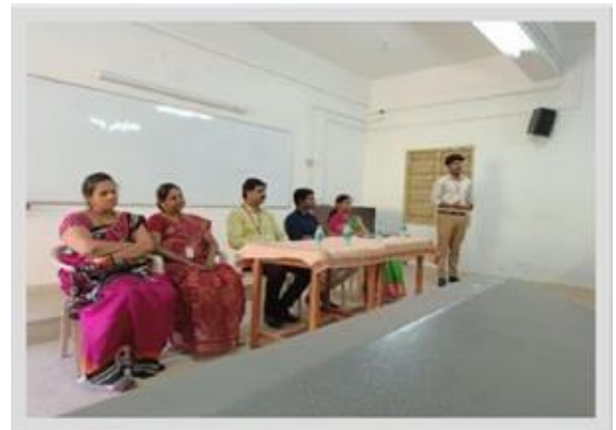
Guest Lecture Session