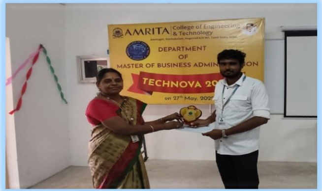
First Prize Winner of Best Manager