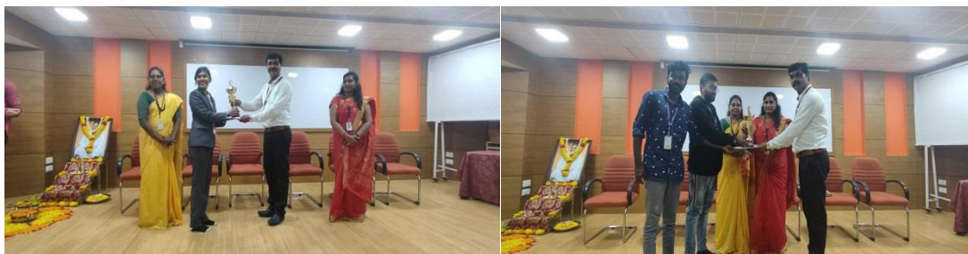
Prize Distribution for Winners