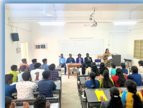
Guest Lecture Program